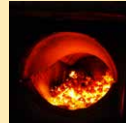
Stoke the fires!

The YPG warrants mention in itself: this is a carefully-supervised group for 13-15 year old volunteers, which prepares them for joining as an adult volunteer in a variety of roles, including 'permanent way' (maintaining the track), the locomotive and rolling stock departments (repairing as well as helping to crew the engine when old enough), stations duties, catering and tour guiding. Our challenge is to make sure that we pass the knowledge and experience down through the generations to ensure we have the expertise in future decades. With this in mind, we intend to refurbish our engineering and storage areas at Haworth, which will give us a better training facility, and also give us a better viewing area for visitors, who currently get to see very little of the magic that happens in Haworth shed, where our volunteers breathe life back into 100+ year old steam locomotives, and have done since the first steam locomotive